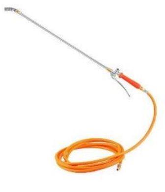
VV78350 SINGLE NOZZLE SPRAYER KIT